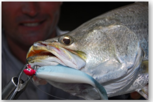
"Barra on a 4 inch Gulp Pogy"

We have a busy year planned with lots fishing all over our great country. We hope to bring some of the best piscatorial photography and footage in the business. We will try to cover everything from bass in some of our most pristine river environments,